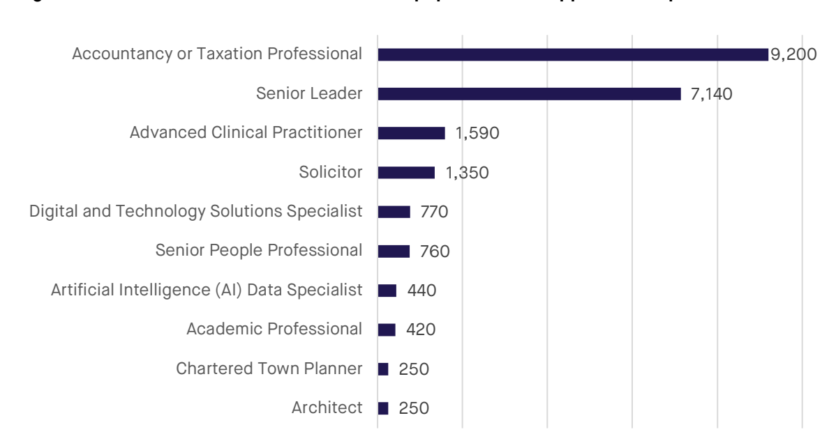
Figure 2: The number of starts on the 10 most popular Level 7 apprenticeships in 2023/24

Not only is the provision of Level 7 apprenticeships consuming more funding than in the past, but the precise make-up of this provision is particularly striking. Of the 23,860 Level 7 apprenticeships started in 2023/24, 16,340 (68%) were accounted for by just two apprenticeships: 'Senior Leader' (7,140 starts) and 'Accountancy or Taxation Professional' (9,200).